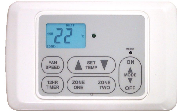
DIAGRAM OF WCS-201HZ WALL CONTROL